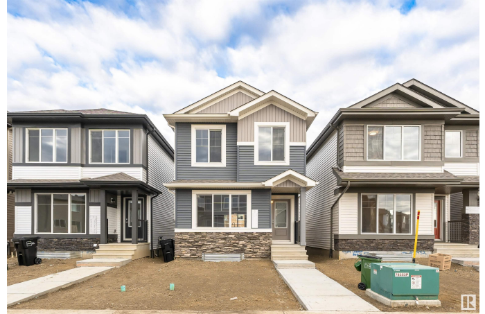
9566 Carson Bnd SW, Edmonton, AB

Main Floor Exterior Area 65.32 m 2 Interior Area 59.37 m 2